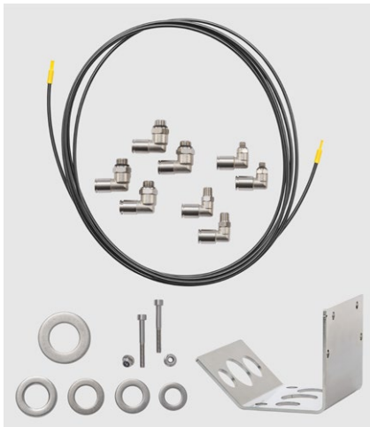
FAG CONCEPT2 E KIT fitting kit