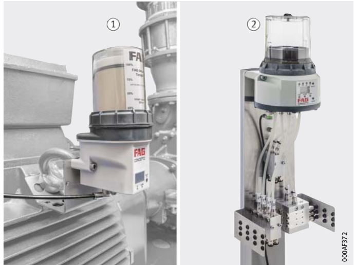
Figure 1 Application examples of device holders

The device holders facilitate the mounting of the lubricators CONCEPT2 and CONCEPT8 directly on the equipment to be lubricated or in its vicinity.