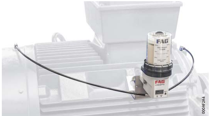
Figure 1 Mounting example CONCEPT2 EKIT

The complete package EKIT allows the rapid refitting of electric motors to the lubricator CONCEPT2. In addition to the lubricator, it contains all the accessories required for mounting and lubrication. It thus facilitates simple conversion to fully automatic relubrication.