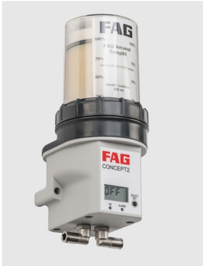
FAG CONCEPT2 for lubrication of two bearing positions